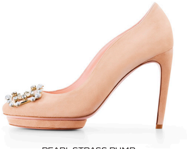
PEARL STRASS PUMP