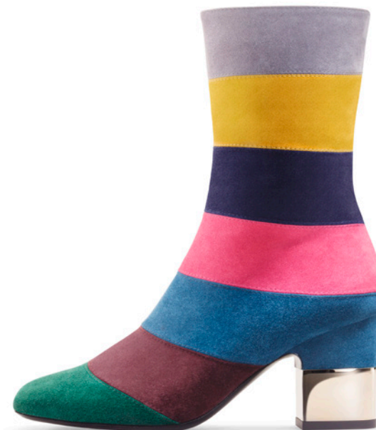
BOOTIE PODIUM STRIPES