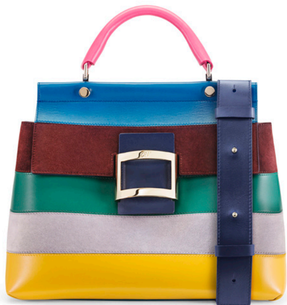
VIV' CABAS STRIPES