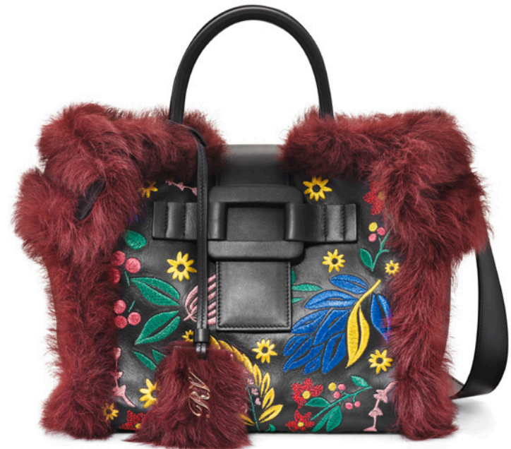
PILGRIM DE JOUR OTTOWOMAN