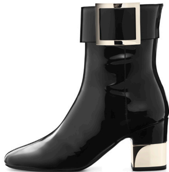
SQUARE PODIUM BOOTIE