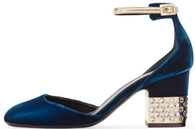
MARY JANE PODIUM