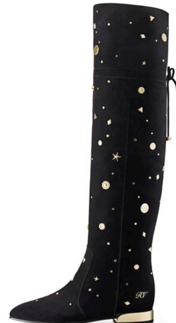
STARS KNEE HIGH BOOT