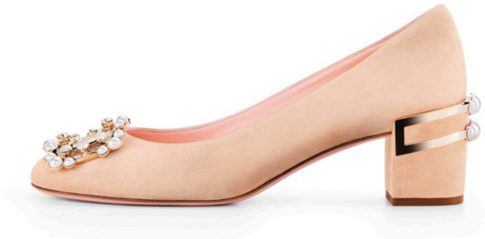
PEARL STRASS PUMP