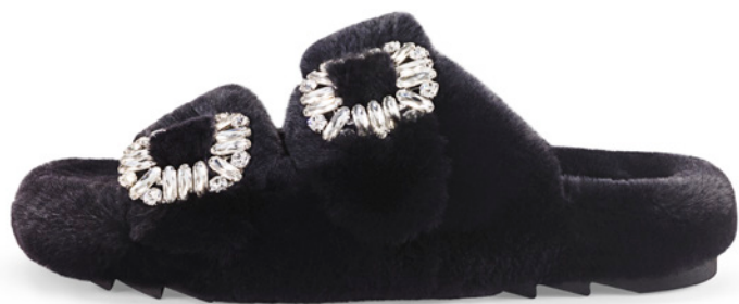
SLIDY VIV' MINK