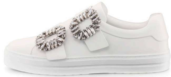
DOUBLE SNEAKY VIV'