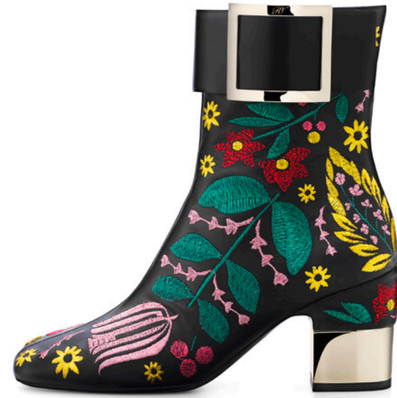
SQUARE PODIUM BOOTIE OTTOWOMAN