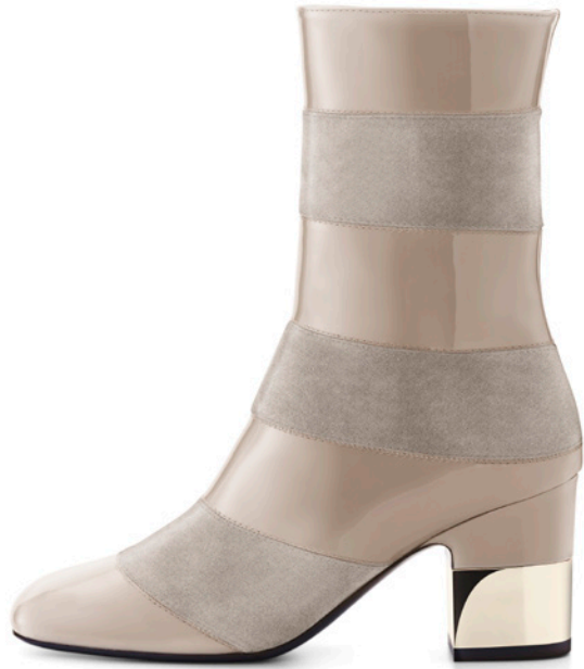
BOOTIE PODIUM STRIPES