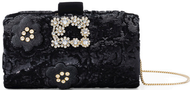
SOFT CLUTCH GUIPURE PAILLETTE