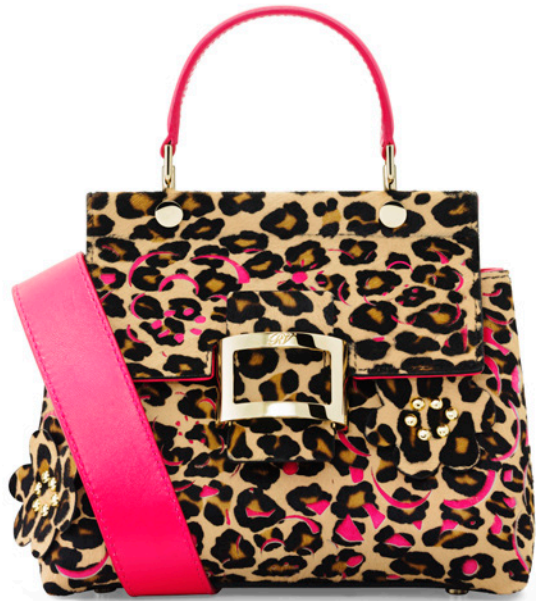
VIV' CABAS GUIPURE LEOPARD MINI