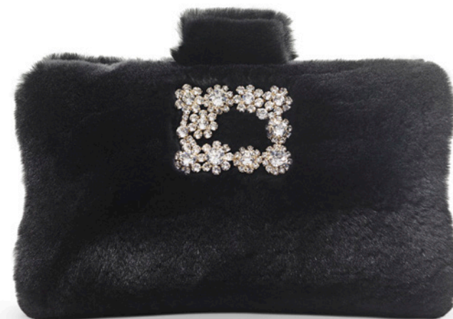
SOFT CLUTCH FLOWER STRASS MINK