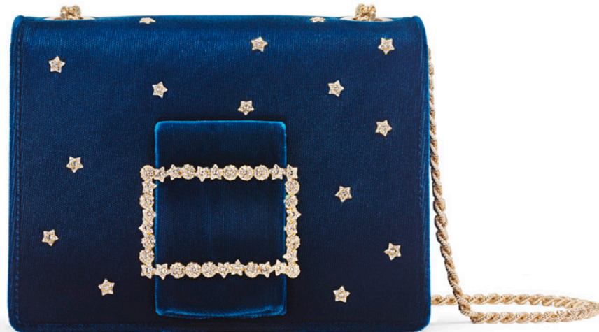
VIV' MICRO STARS