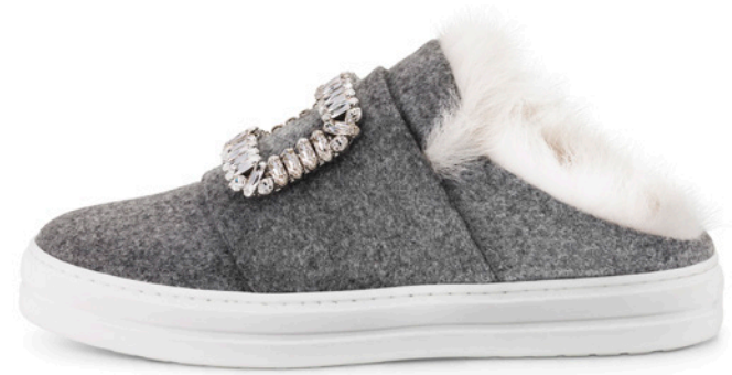
MULE SNEAKY VIV'