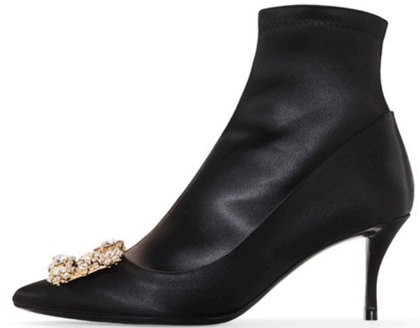
STRETCHY FLOWER STRASS BOOTIE