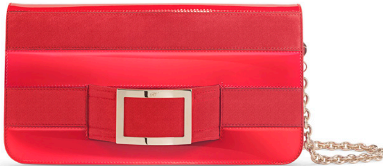
KEEP-IT VIV' STRIPES