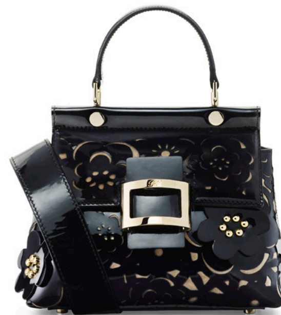
VIV' CABAS GUIPURE MINI