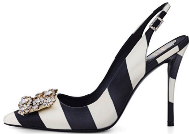
SLING BACK STRIPES FLOWER STRASS