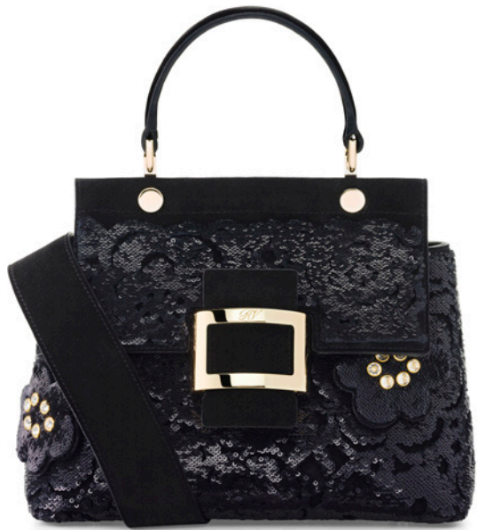
VIV' CABAS GUIPURE SEQUINS MINI