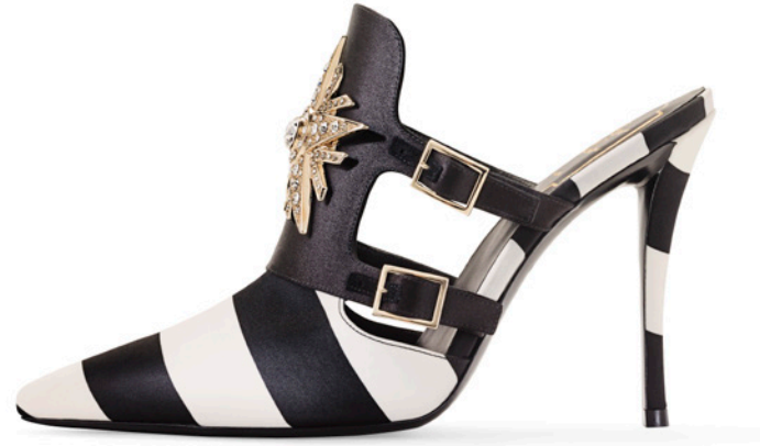
MULE STAR STRIPES