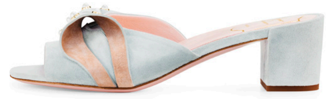
PEARL STRASS MULE